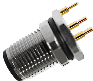
M12 Male Panel Mount, PCB Type, Front Fastened, Shielded Pin