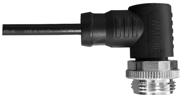
7/8" Male Molded Cables, Angled